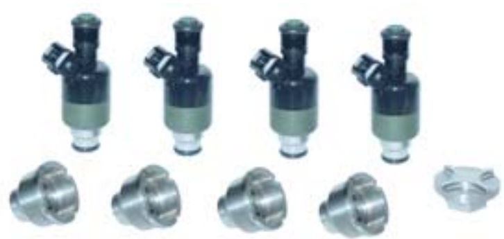
APR Injectors with Seats and Special Tool